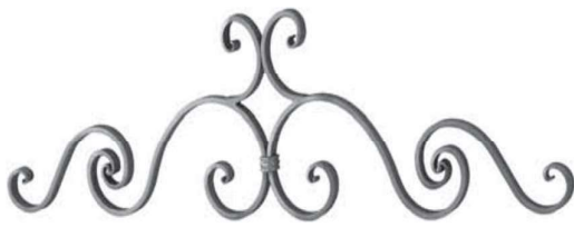
≠16x6 200x770 NEW0013

Via Adige, 20 21043 Castiglione Olona (Va) Tel. 0331859839 info@ferrodesignsrl