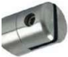
FISSAGGIO x LAMIERE D25 BASE PIANA ART. AF062406 INOX