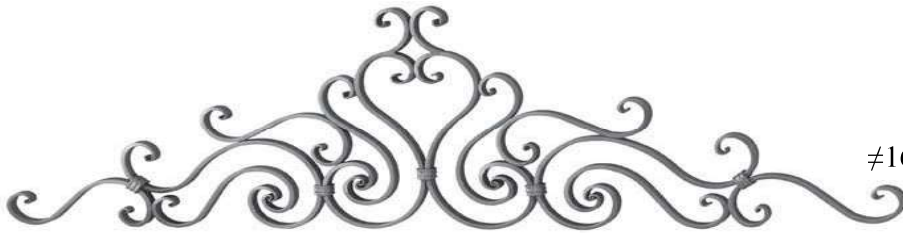
≠16x6 320x1100 NEW0015