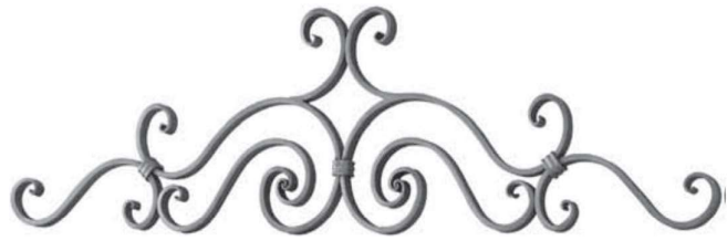
≠16x6 220x830 NEW0014